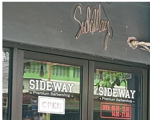
Figure 7. A barbershop named “Sideway”

Another interesting motivation for using the English language in Kampung Inggris Pare is resistance from local society. Pare is well known as Kampung Inggris since English courses mushroomed and developed over there. Even though Pare is known as Kampung Inggris, the local speaking language is still Javanese. Getting wider English courses in Kampung Inggris Pare encourages local society to maintain their local language, Javanese. That is by using a combination of English and Javanese in public spaces as their resistance. See Figure 3, food enterprise sign namely “Kluwen Rice Bowl”. The word Kluwen is from Javanese with the meaning of starving in English. This word is combined with English as the brand name of food here.