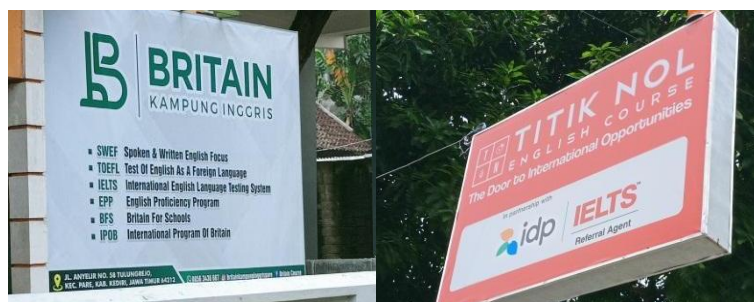
Figure 2. English enterprise signs with English monolingual and bilingual text

Figure 1. Percentage of English on the English enterprise signs/non-English enterprise signs English on English enterprise signs is only found in monolingual and bilingual text (See Figure 2) while English is used monolingually, bilingually, and multilingually on non-English enterprise signs (See Figure 3). Javanese as the local language in Pare does not appear on English enterprise signs, but it is used bilingually and multilingually on non-English enterprise signs. Regarding the frequency of Javanese in Table 1, the data indicate English in Kampung Inggris Pare threatens this local language. There should be a significant step from the local government to revitalize Javanese in this area because the English language is progressively growing here. This finding also indicates that the language regulation from the government has not been applied successfully in Kampung Inggris Pare. There should be more decisive and significant action from the government to handle this situation.