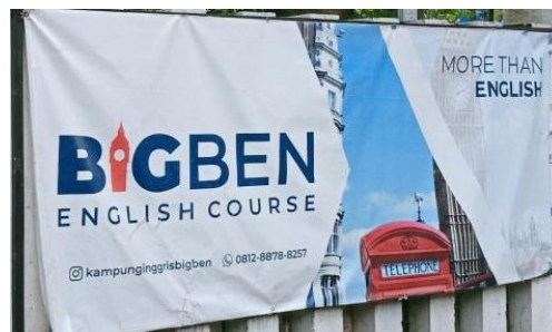
Figure 5. An English course sign

The English language also projects a success orientation on enterprise signs in Kampung Inggris Pare. In this orientation, English is used to give an image of elitism, prestige, and sophistication. As in Figure 7, It is a barbershop with the English name “Sideway”. The information about that barbershop is also written in English, whether it is open or closed and when it will open. There is also a tagline “Premium Barbershop” below the brand name. This tagline emphasizes the use of English on this sign to picture a success orientation with elitism, prestige, and sophistication. There are two ways the writers wrote the name “Sideway”. The first is on the wall above the door with a handwritten writing type, it gives an aesthetic value of this enterprise. Meanwhile, the second is on the door with bold capital letters, it gives a strengthening of the English name “Sideway” to present an image of elitism, prestige, and sophistication.