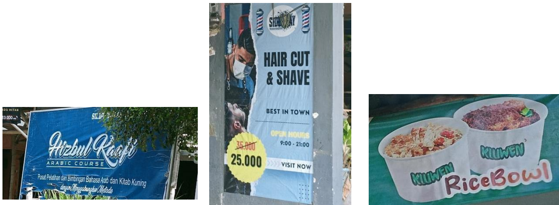
Figure 3. Non-English enterprise signs with English monolingual, bilingual, and multilingual text