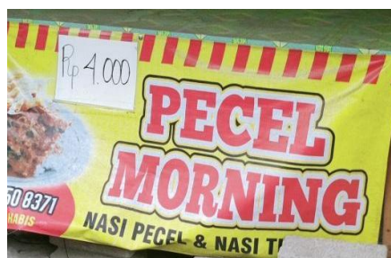
Figure 8. A food stall named “Pecel Morning”

Another interesting motivation for using the English language in Kampung Inggris Pare is resistance from local society. Pare is well known as Kampung Inggris since English courses mushroomed and developed over there. Even though Pare is known as Kampung Inggris, the local speaking language is still Javanese. Getting wider English courses in Kampung Inggris Pare encourages local society to maintain their local language, Javanese. That is by using a combination of English and Javanese in public spaces as their resistance. See Figure 3, food enterprise sign namely “Kluwen Rice Bowl”. The word Kluwen is from Javanese with the meaning of starving in English. This word is combined with English as the brand name of food here.