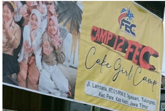
Figure 4. A homestay named “Cake Girl Camp”

English on enterprise signs in Kampung Inggris Pare also projects an internationalness orientation. As Figure 5, an English course uses Big Ben as its name and is supported by using the English language on its sign. The word choice “Big Ben” which refers to a famous cultural landmark in London gives an image of global and cosmopolitan which can be a motivation of this English course to their students to study English to reach their dreams of studying or working overseas. This word choice is also pointed out by replacing the letter ‘i’ with a symbol of “Big Ben”. The global image on this sign can also be seen in the font size and in the position of Big Ben. It is written in capital letters and bolded strongly above the English course letters. Moreover, the tagline of “More than English” is placed in the right-upper position which refers to something new from the writers to the readers. This position emphasizes the writer’s intention to present global and cosmopolitan images to represent an internationalness orientation in advertising their enterprises.