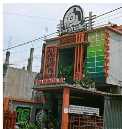
Figure 6. A distribution store named “Pareholic”